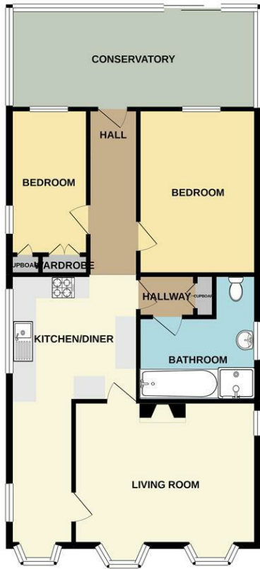
GROUND FLOOR 998 sq.ft. (92.7 sq.m.) approx.